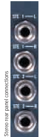
Stereo rear panel connections