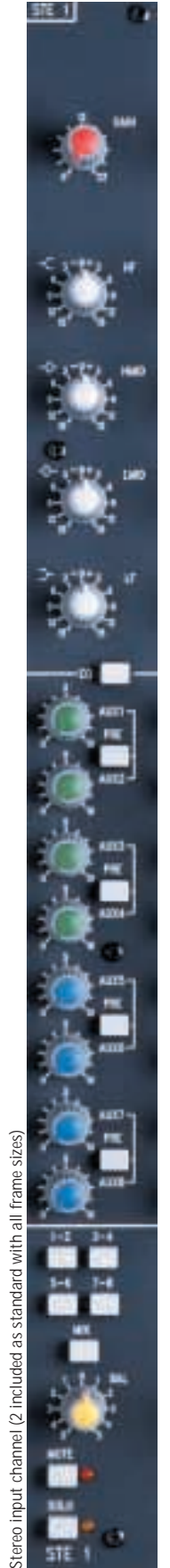
Stereo input channel (2 included as standard with all frame sizes)