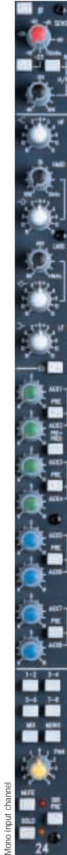
Mono input channel

Inputs to the two stereo channels are via four balanced 1/4" jacks.