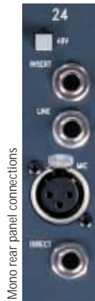
Mono rear panel connections