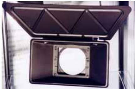
Fig 1 Matte Box Front View

The FM500 Matte Box is the entry level offering from Formatt Filters and represents excellent value for money for all videography work.