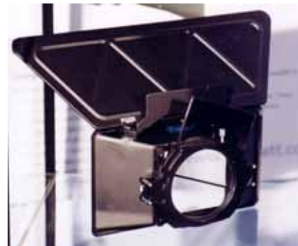
Fig 2 Matte Box Rear View

The matte box comes complete with ray shade suitable for most videography work including wide angle in most cases. The French Flag is rotatable through 180°. The powder coated black matte interior removes flare and ghosting.