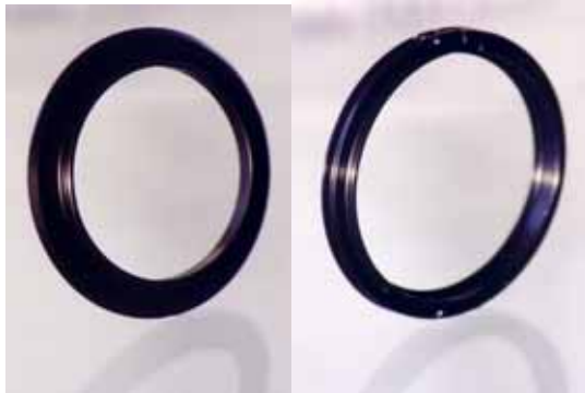
Fig 4 Screw Adaptor Fig 5 Clamp On Adaptor

specifications for your camera. Where no internal thread is available on the lens barrel a clamp on ring is needed. The table below shows the adaptor sizes available.