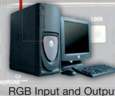
RGB Input and Output