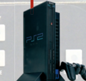
Games Console or other source