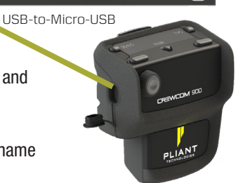
CRP-12 Radio Pack