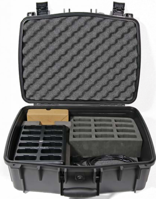
CHG 1012 PRO