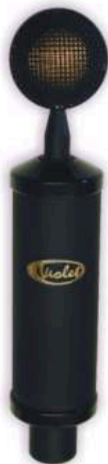
THE DOLLY VINTAGE