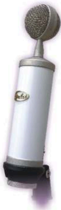
THE DOLLY STANDARD