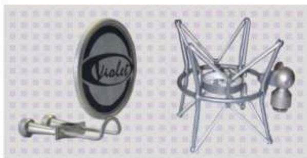
DSP Studio Kit (VSMD + DPF)