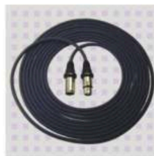
VMC-06 quad microphone cable (6 m)

In the interests of product development, the specifications, construction and appearance of all above products are subject to change without prior notice and without obligation to install these improvements in any product previously manufactured.