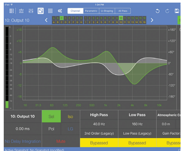
Compass Go Screen