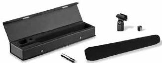
frequency response: 40–20,000 Hz

Specifications are subject to change without notice.