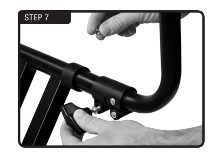
Install hand z-knob, washer, and hex nut. It is important to place the hand knob on the inside or stand will not fold fully. Also, be careful not to over-tighten the hand knobs because over-tightening may case cracking of the collar.