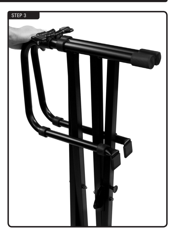
Fold stand into closed position and push 2nd tiers in. Tighten 2nd tier z-knobs.