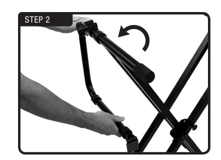
Pull tier to the outside of the IQ-1000 or IQ-2000.