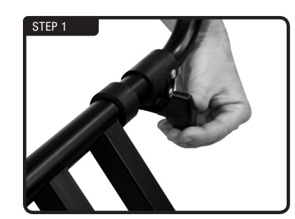
Loosen z-knob until resistance is gone. You do not have to completely unscrew for hex nut to adjust second tier.