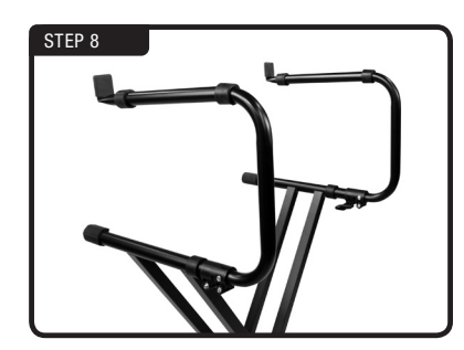
Repeat steps 1-7 with other 2nd Tier Assembly.