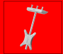
HM-400 Under-cabinet bracket