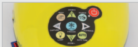
Controls on base