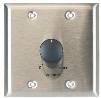
Standard Two-Gang Plate Stainless Steel

The volume control shall be Lowell Model with 200W power rating, 3dB per step attenuation and two 6dB positions before "Off." The control shall have plug-in termination for up to 14-gauge wire for 70V or 100V input connections from the amplifier and 70V or 100V output to the speaker/transformer assemblies. The plate shall be two-gang _ (standard, Decora®) style with __ (stainless steel, stainless steel & black) finish. It shall feature a black rotary knob. The volume control shall mount in a standard two-gang E.O. box with minimum depth of 2.5" including mud ring, if used. The box is not included.