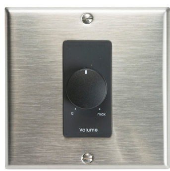
Decora Style Two-Gang Plate Stainless Steel & Black