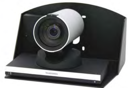
Figure 3: Cisco® PrecisionHD 1080p 12x Camera Shown with mount and EZIM behind Camera (Camera and Codec Not Included)