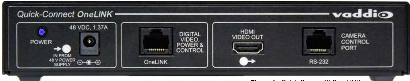
Figure 1: Quick-Connect™ OneLINK

Vaddio™ OneLINK - High Speed Digital Bus for HD Digital Video, Power and Control Over One Cat-5e Cable Part Numbers: 999-9550-000 - North America, 999-9550-001 - International