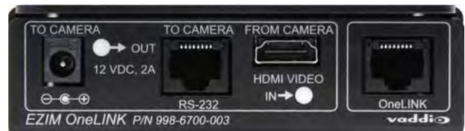
Figure 2: EZIM™ OneLINK High Speed EZ Interface Module (Placed out at the camera/mount)

The OneLINK system sends and regulates power to the camera, provides a bi-directional control channel for RS-232 and transmits/receives uncompressed HD digital video up to and including 1080p/60Hz, all on One (1) Cat-5e cable, hence the name, OneLINK. The OneLINK is a complete peripheral system and comes with the Quick-Connect, the EZIM, and three 1' (30.5cm) native cables at the camera (HDMI, 5.5mm OD x 2.1 mm ID power cable, and RJ-45 patch cable). We even go as far as including a totally awesome camera mount made specifically to mount the PrecisionHD series PTZ cameras and the EZIM.