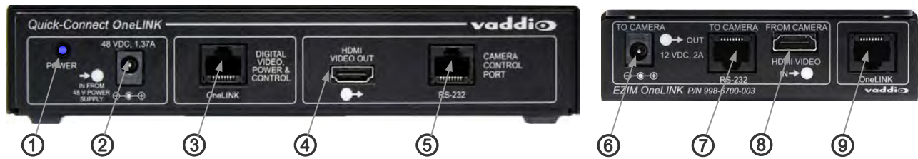
Figure 4: OneLINK Quick-Connect and EZIM connectors and functional callouts