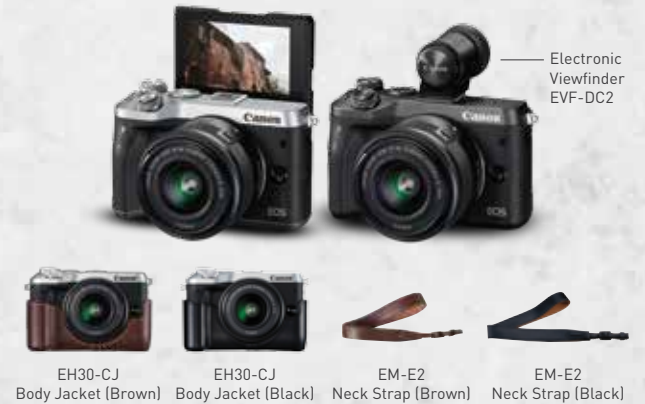
EH30-CJ Body Jacket (Brown) EH30-CJ Body Jacket (Black) EM-E2 Neck Strap (Brown) EM-E2 Neck Strap (Black) Electronic Viewfinder EVF-DC2

For even more creative opportunities, choose from 3 selectable shooting intervals to shoot your favourite time-lapse videos.