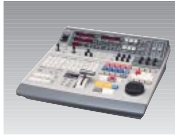
FXE-120 Video Editing System