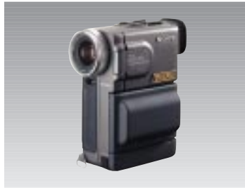
DSR-PD1 Digital Camcorder