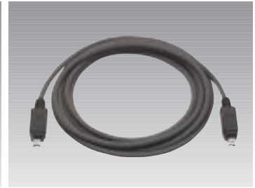
VMC-2DV/4DV DV Cable