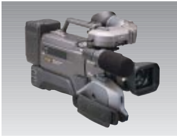
DSR-200A Digital Camcorder