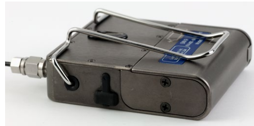
A USB port on the side panel is used for firmware updates.

Digital Hybrid Wireless® is a patented design that combines 24-bit digital audio with an analog FM radio link to provide outstanding audio quality and the extended operating range of the finest analog wireless systems. The design overcomes channel noise in a dramatically different way, digitally encoding the audio in the transmitter and decoding it in the receiver, yet still sending the encoded information via an analog FM wireless link. This proprietary algorithm is not a digital implementation of an analog compandor. Instead, it is a technique which can be accomplished only in the digital domain, even though the audio inputs and outputs are analog signals. *US Patent 7,225,135