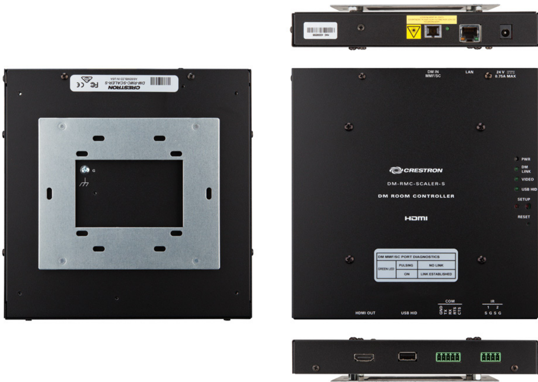
DM-RMC-SCALER-S – Rear, Top, Front, and Bottom Views