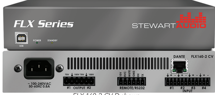
FLX 160-2-CV-D shown

The FLX Platform is the most versatile 1/2 rack networked amplifier Stewart has ever produced. This compact package contains over 300 watts of power output in various channel configurations and impedances. At the heart of the platform is a robust, internal full function DSP that is designed to solve a multitude of your audio problems in just one box. The channel count varies from 1-4 channels and the DSP allows further configuration via routing, EQ, filters, limiters and much more. A USB port makes programing simple, fast and repeatable for large installations. The RVC and RS232 control allow volume control from a wide range of devices. In addition, the FLX platform has an optional factory installed Dante<sup>™</sup> card with 4 channels of networked audio in and out. You won't find a more flexible combination of power output and processing in a comparable package on the market today.