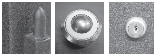
(L to R) Pin for optional front door can be moved to change swing orientation; stainless steel balls help transfer weight smoothly as cabinet swings open; front key lock secures cabinet to backbox while allowing side-by-side installs.

able to left swing orientation. The cabinet shall feature vented side panels, one pair of adjustable mounting rails, and a keyed lock to secure it to the backbox. It shall include side-mounted fixed rails to accommodate optional power strips. The open top shall have knockouts for conduit, knockouts for BNC antennas, lacing points, and provisions to attach board-mounted accessories. The base shall include stainless steel ball transfers and two access panels to provide an additional 4U of panel space when the front panel is removed. It shall have a load rating of 500 lbs. The backbox with center opening shall be 4.69"D and mount on 16" centers.