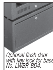
Optional flush door with key lock for base No. LWBR-BD4.

Single Fan Kit (FW1-KIT): Single whisper fan for spot cooling mounts to special notches in rack vents. 50cfm airflow.