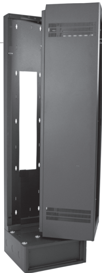
Extra 4U rack space in base — ideal for optional 4U utility drawer.

The E.I.A. compliant wall-mount rack shall be Lowell Model No. LWBR-4022, which shall consist of a backbox and cabinet with base. Overall measurements shall be 85.78"H x 22.4"D x 23.06"W with 40U rack space. Construction shall be 16 gauge welded steel with beveled corners and black wrinkle powder epoxy finish. The cabinet shall provide 90 degree pivot capability and swing open from a right hinge, which shall be field-change-