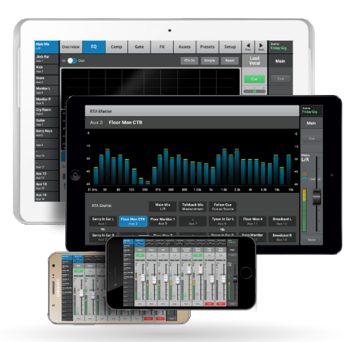
TouchMix Control App for iOS<sup>®</sup> and Android<sup>™</sup> devices

Modern digital mixing consoles are all fully featured — sometimes to the point of being nearly incomprehensible to all but the most experienced operator. The TouchMix design team set out from the start to create a mixer with an intuitive workflow and straightforward navigation that is understandable for the less experienced user and fast for the professional — all without sacrificing features or capabilities. As a result, the mixer is extremely easy to learn and operate. Many TouchMix functions such as EQ, compressors, gates and limiters offer a choice of Advanced Mode operation with total control over all parameters or Simple Mode that presents only the most essential controls.