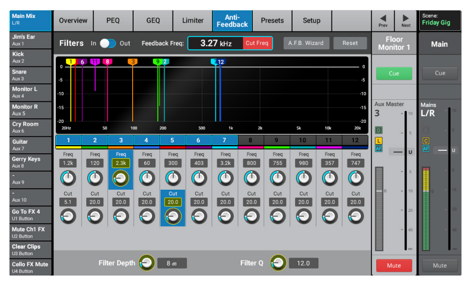
The TouchMix-30 Pro's Anti-Feedback Wizard is just one of its many powerful time-saving tools

Performers are increasingly demanding when it comes to monitor mixes. Not only do individual musicians want their own mix, but the use of in-ear monitors (IEM) is increasing, driving a need for stereo Aux mixes. To meet this requirement, the TouchMix-30 Pro offers 14 Aux busses. All Aux busses may be linked for stereo operation and mixes 11/12 and 13/14 include additional outputs that can drive wired in-ear monitors directly.