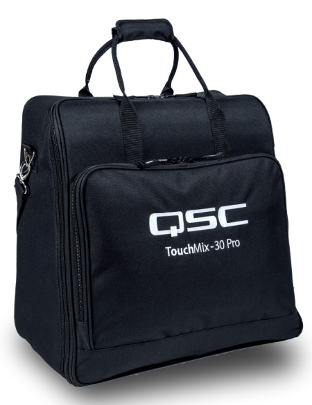
TouchMix-30 Pro Tote