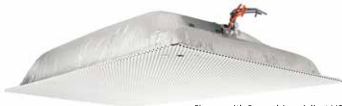
Shown with Screwdriver Adjust VC

The SYSTEM 5/VC is a complete, shallow depth, lightweight, 1' x 2' ceiling tile replacement loudspeaker system consisting of an 8C5PAX - 8" O.D. dual cone loudspeaker with a 5 oz. magnet and a TBLU - 5W-25/70V transformer with screwdriver or knob adjusted volume control. Molded fiber enclosure is 617 CID. Powder coated steel baffle with standard perforation and four (4) seismic tie-off points. The cable clamp and one (1) 24" "T" rail are included. No assembly required.