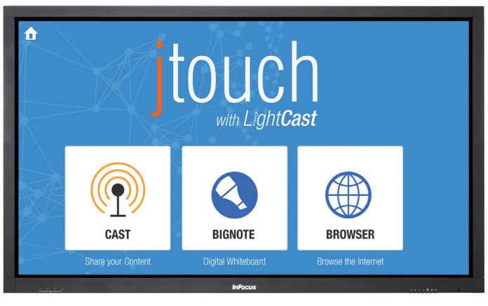
65" JTouch Whiteboard with LightCast (INF6501CB/INF6501CBp)