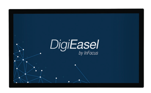
DigiEasel works in either portrait or landscape mode.