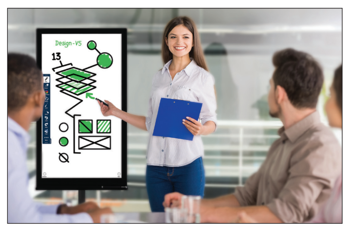
40" DigiEasel (INF4030/INF4030p)