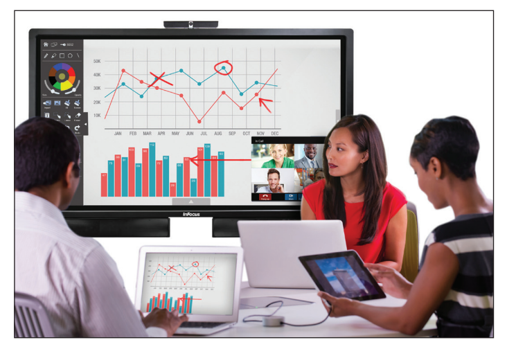
70" Mondopad (INF7021)