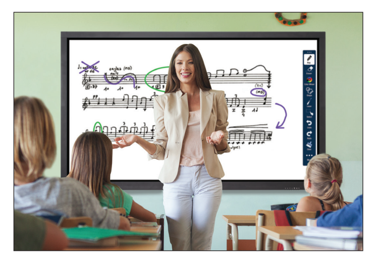
80" JTouch (INF8002)