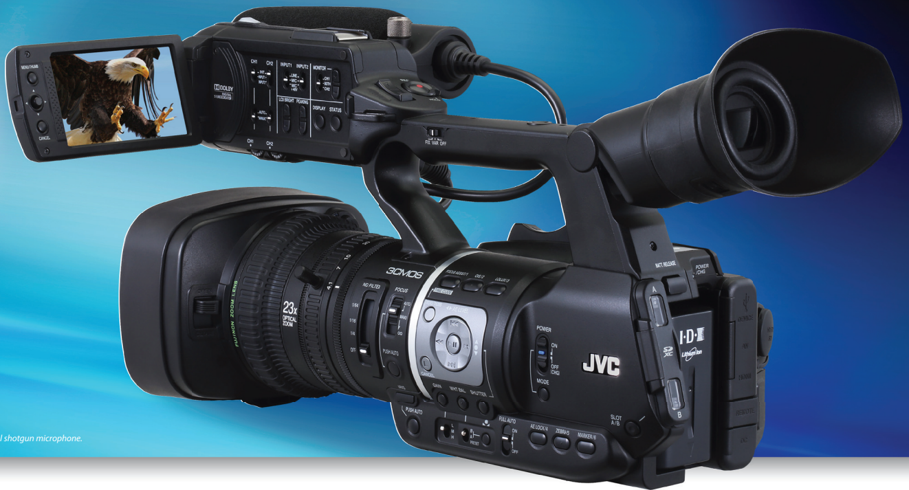
Camera shown with optional shotgun microphone.

The GY-HM620 is an advanced handheld ProHD camera that delivers unsurpassed imagery and offers features for news, sports, and independent production. Based on JVC's popular GY-HM600, the new 620 has upgraded CMOS devices for greater sensitivity and a brighter LCD display for outdoor daylight viewing. Versatile and extremely easy to use, there's no better camera for fast paced HD field production.