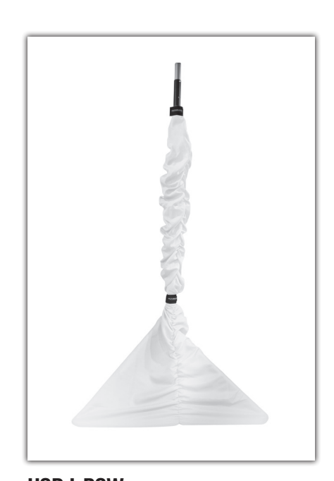
USDJ-PSW, #17410 Tripod Pole Sleeve & Skirt - White, Pair