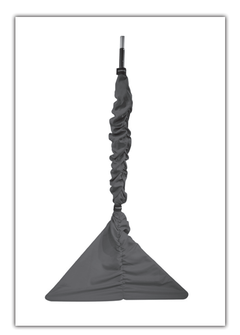
USDJ-PSB, #17409 Tripod Pole Sleeve & Skirt - Black, Pair

Attractive Pole Sleeves and Skirts for Tripod Stands - Black or White (Pair)