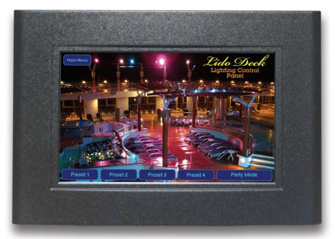
CT-400 CueTouch LCD Touchscreen