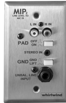
MIP2S (Stainless) MIP2B (Black)

The MIP2 is a one gang wallplate with a mono version of the Whirlwind pcDI computer interface device featuring RCA and 3.5mm stereo input jacks. The line inputs are summed together and sent to the Dimax transformer which balances the output signal and attenuates it by 20 dB.. There is a Pad switch on the MIP2 which attenuates the output signal an additional 20 dB when activated. A Ground Lift switch breaks the ground connection between the inputs and the output screw terminal.