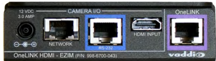
Images: OneLINK HDMI EZIM™ Camera Interface (above) and OneLINK HDMI Interface Front Panel (below).

Vaddio's OneLINK System for RoboSHOT HDMI cameras is an HDBaseT camera extension system that extends HDMI video, power and control on a single Cat-5e/6 cable at distances of up to 328' (100m). OneLINK allows for simplified, economical and faster installations. The OneLINK system sends and regulates power to the camera, provides bi-directional control channels for Ethernet and RS-232 and transmits/receives uncompressed HDMI video up to 1080p/60 and up to 2160p/30 for the future.