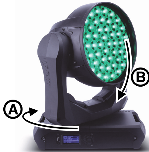
Figure 3: Pan/tilt adjustment positions