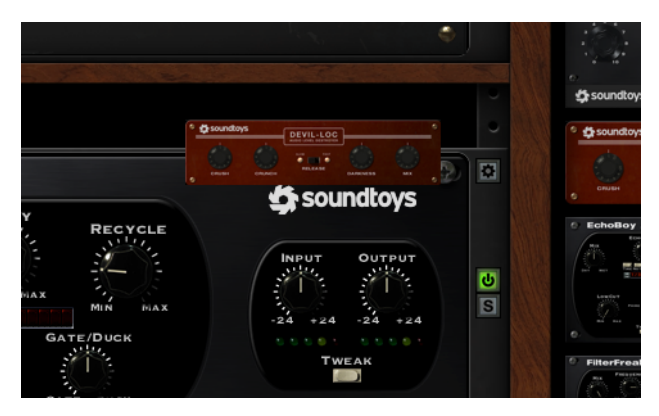
Figure 4: Inserting above an existing Rack item

of Devil-Loc above Crystallizer would look before it is secured into the rack: