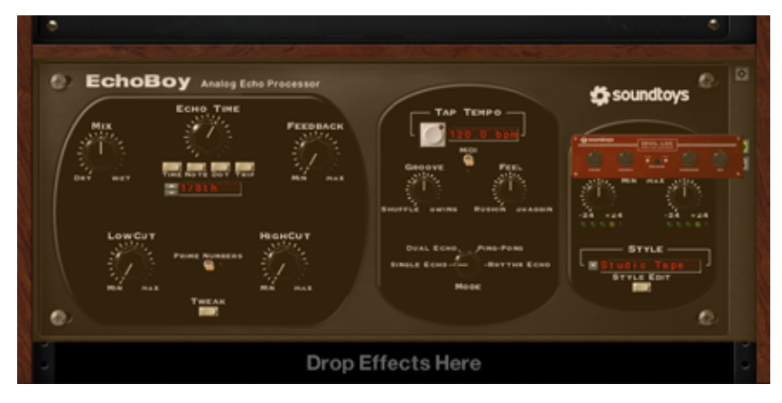
Figure 5: Replacing a Rack item

You can also swap out rack pieces where the newly inserted piece of gear will take the place of an existing piece and remove it from the rack. To do this, simply drag your new item to the Rack and center it over the piece of gear you would like to replace. You will see that the entire effect to be replaced will be highlighted yellow (as shown in Figure 5 below)