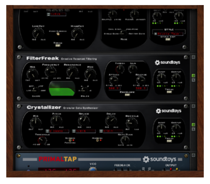
Figure 3: Soundtoys Effect Rack's Rack - Loaded!