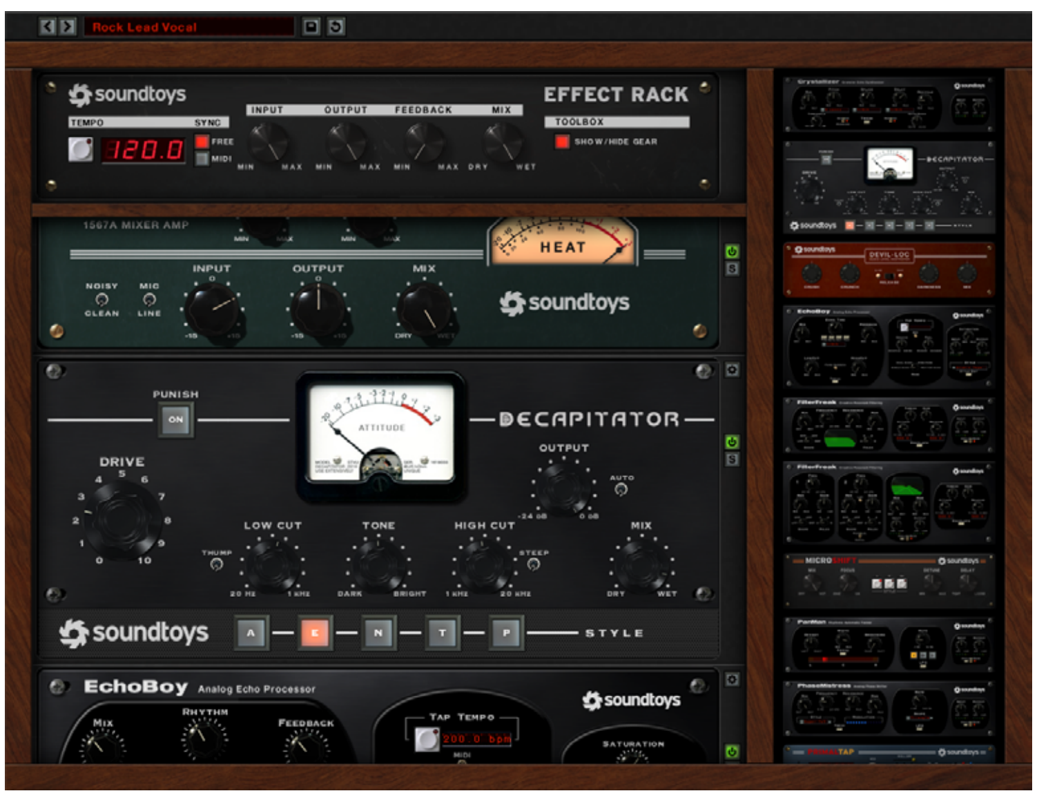
Figure 1: Soundtoys Effect Rack loaded up and ready to go!