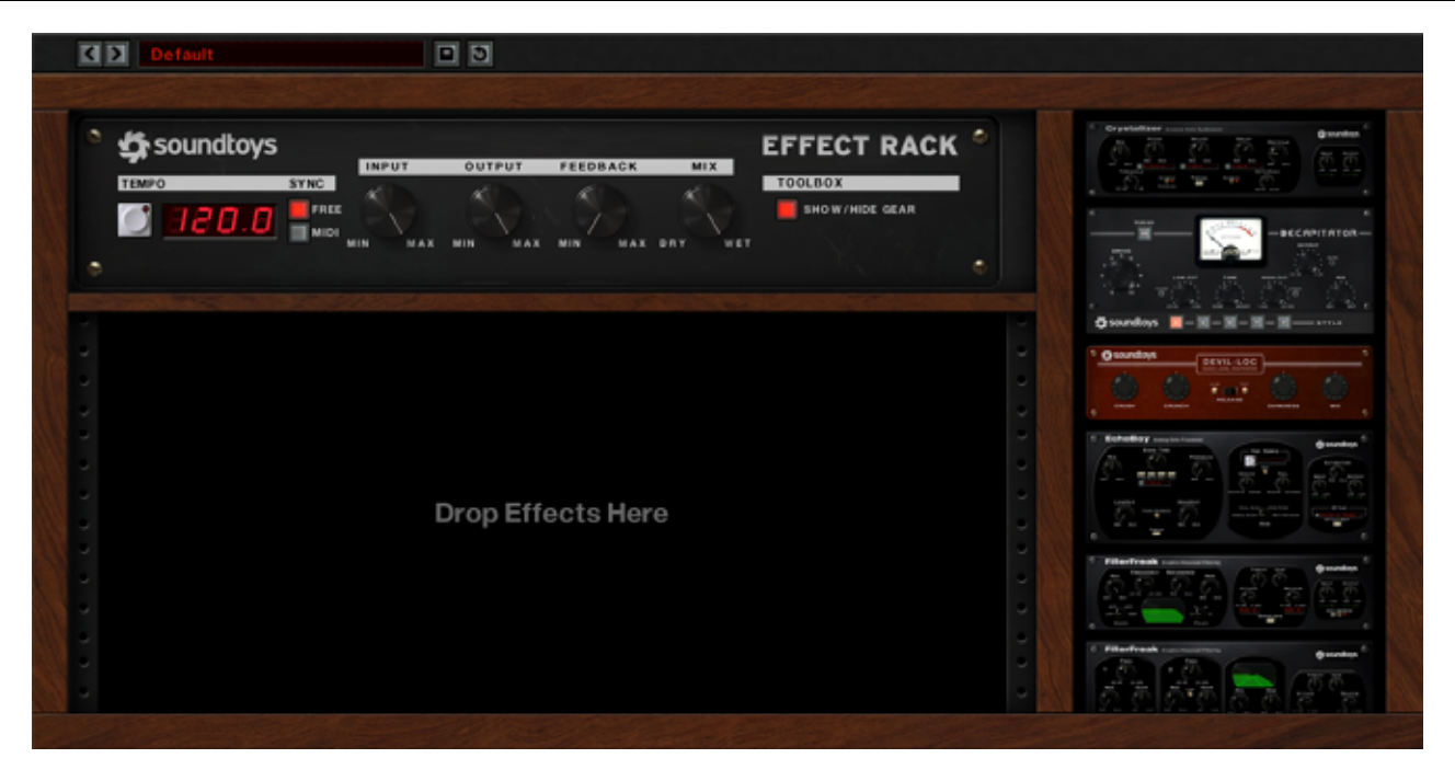
Figure 2: Empty Effect Rack with Gear List displayed