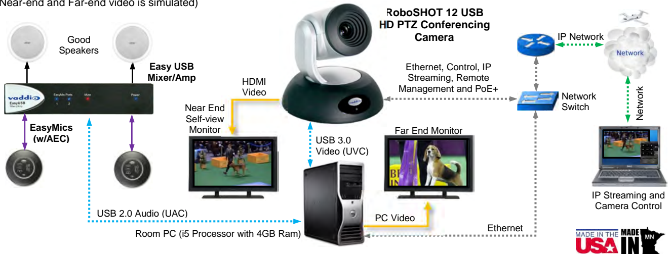
RoboSHOT 12 USB, EasyUSB™ Mixer/Amp, EasyMics, UC Conferencing Application, Monitors and Speakers (Near-end and Far-end video is simulated)