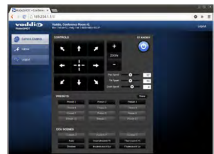
Example: Built-in Camera Control Web Page