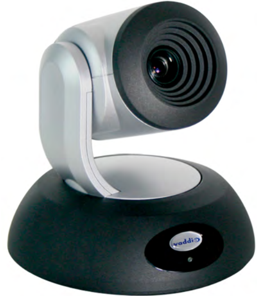
Image: RoboSHOT 12 USB, HD PTZ Camera with 12X Optical Zoom and 73° Wide Horizontal Field of View

The RoboSHOT 12 USB camera was designed for the times and represents a new era in specifying and integrating professional quality cameras into UC Conferencing and Pro AV system configurations. The features, flexibility and the value of the RoboSHOT 12 USB conferencing camera is unparalleled in today's PTZ camera market. All this and it's made in the USA, at the Vaddio HQ in Minnetonka, Minnesota.