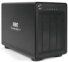
OWC ThunderBay® 4