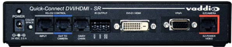
Figure 1: Rear Panel of the Quick-Connect DVI/HDMI - SR Interface (1/2 Rack Width Enclosure)

Overall, the combination of the Quick-Connect DVI/HDMI - SR Interface and HD-Series PTZ cameras with its many available packages, is a remarkable choice for a wide range of HD analog and HD digital video applications.