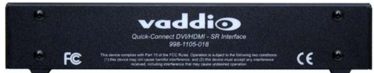
Figure 2: Front Panel of the Quick-Connect DVI/HDMI - SR Interface (Optional Accessory Rack Mount Panel Available)