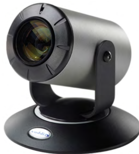
Image: ZoomSHOT 20 HD POV Camera

The advanced ISP (image signal processor) is pretty cool too, providing for fast, razor-sharp auto-focus routines with vivid colors, realistic textures and incredible detail. This ISP combined with the Exmor image sensor achieves an impressive low-light performance of 0.3 Lux (color) and 0.03 Lux (B/W).