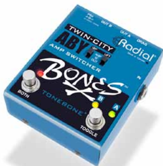
Bones TwinCity - Order # R800 7115