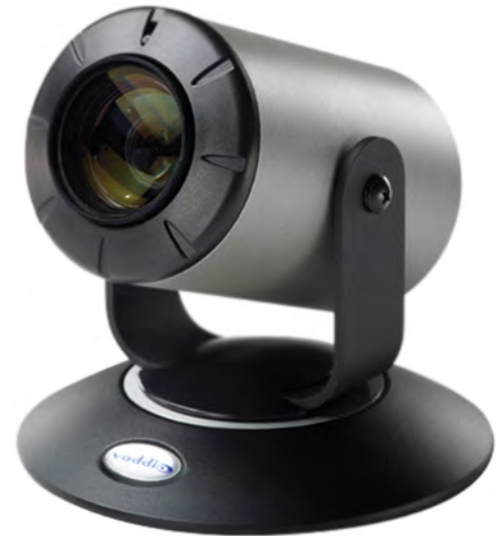
Image: ZoomSHOT 20 HD POV Camera

The ZoomSHOT 20 is an exceptional value and a versatile camera for even the most demanding HD, point of view video applications. It is at home in small, medium and large rooms supporting applications including House of Worship, PRO A/V system integration, distance learning classrooms, live events, IMAG systems, UCC applications, videoconferencing, distance learning and lecture capture. To top it all off, the ZoomSHOT 20 camera is made in USA at Vaddio headquarters in the greater Minneapolis, Minnesota area.