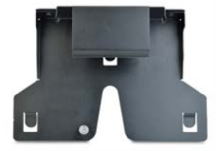
Optional wall-mounting bracket