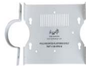
White Pole Mounting Platform Shelf