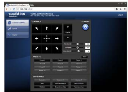
Example: Built-in Camera Control Web Page

The RoboSHOT cameras were designed for the times and represent a new era in specifying and integrating professional quality cameras into A/V and conferencing system configurations. In short, it has never been easier to integrate cameras into any small to medium room project than with the RoboSHOT 12.