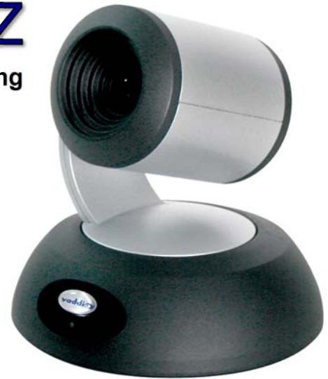
Image: RoboSHOT 12 HD PTZ Camera

The key features of the RoboSHOT cameras are Tri-Synchronous Motion, the silent direct drive pan/tilt motors, advanced Exmor® image sensor, multi-element lens and ISP (image signal processor) combination.