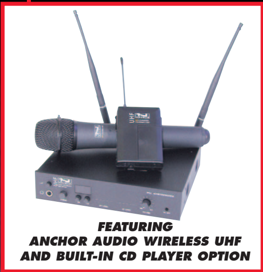
FEATURING ANCHOR AUDIO WIRELESS UHF AND BUILT-IN CD PLAYER OPTION

"We use our Liberty equipment for large audio presentations like graduation ceremonies, administrator conferences, conventions and our annual peace officer memorial. We have had so many problems renting equipment with speakers blowing up or mics cutting out. Now we can set-up in minutes. This system has never failed us, and we pride ourselves on having the best A/V equipment around. We have a lot of other Anchor Audio equipment including the Pelican cases that we use to transport the sound system. We want to protect our investment. Anchor Audio equipment has met all of our A/V needs."