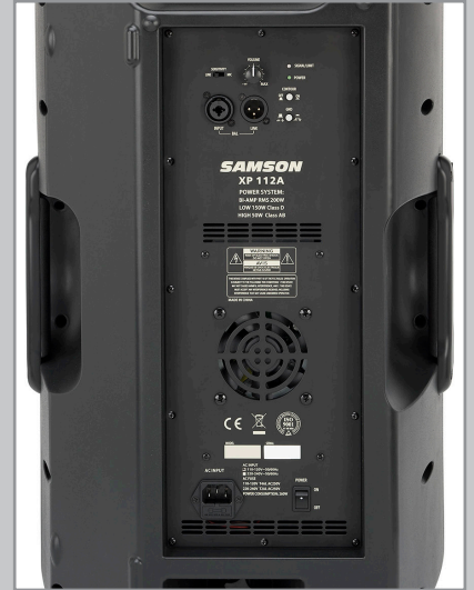
Expedition XP112A back panel

Samson's Expedition XP112A and XP115A 2-Way Active PA Speakers present great options for those seeking premium sound with great value. Combining exceptional portability and power, these are ideal PA speakers for live sound setups. Perfect for bands, DJs, vocal presentations and much more, the Expedition XP112A and XP115A are versatile PA solutions for serious performers.