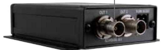
Fiberlink® 3351 Receiver

The 3351 Receiver delivers pristine output with two re-clocked 3G/HD/SD-SDI outputs!