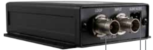
Fiberlink® 3350 Transmitter

The 3350 Transmitter provides a convenient re-clocked and equalized 3G/HD/SD-SDI Loop-Through!