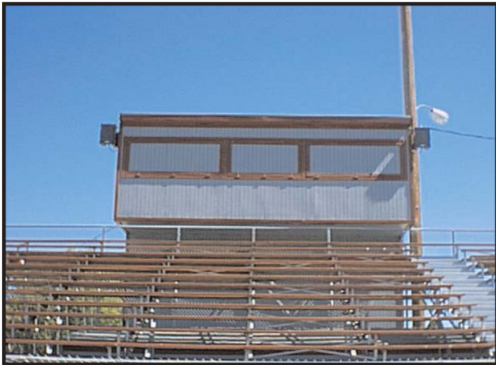
Loudspeakers Installed on Press Box