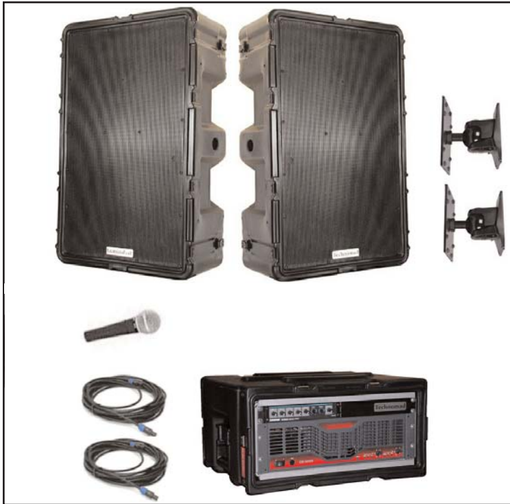
shown: mPA3 PA System - Two Berlin 15/H loudspeakers, amp/mixer rack

Complete audio solutions for mobile or permanently-installed audio