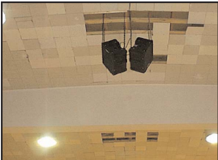
Turnkey PA System Installed in Gym