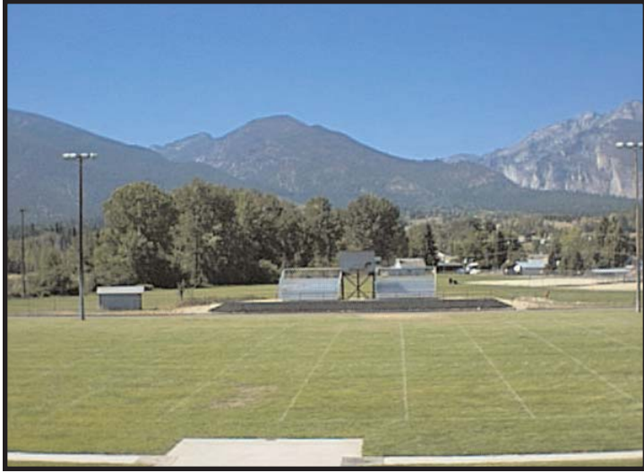
View of a Typical Football Field