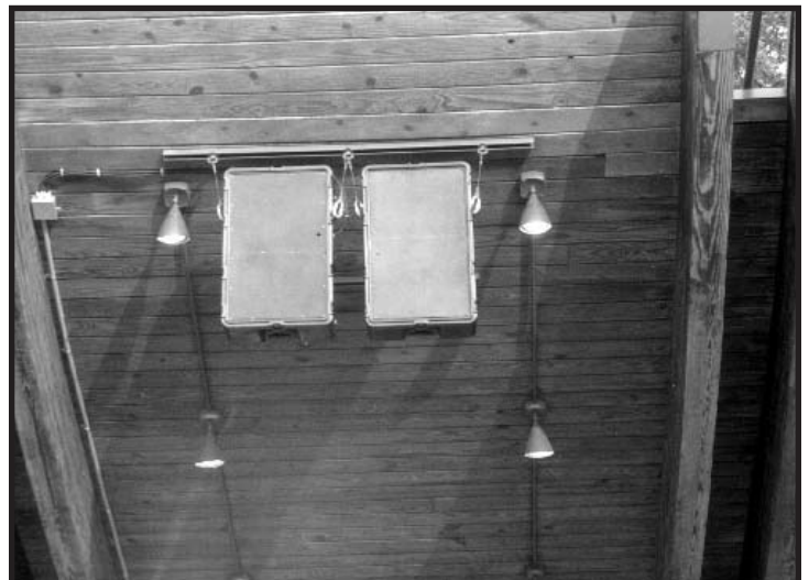
Turnkey PA System in Gym