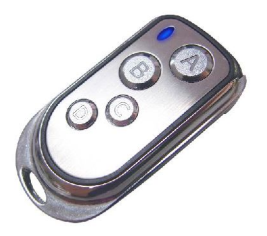
W-2 Wireless Transmitter

Wireless remote control system W-2 consist of a transmitter equipped with four buttons to activate four user configurable LED setting and fog; with an onboard receiver attach to the rear panel of Z-1520 RGB.