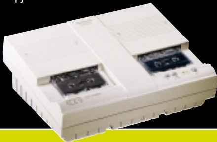
Copyette EH 1•2•1

Produces one copy from a cassette master. Stereo (1/4 track) and Mono (1/2 track) versions