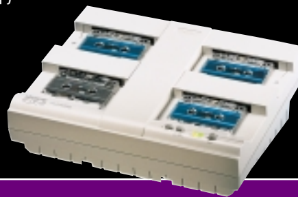
Copyette EH 1•2•3

Produces up to three copies from a cassette master. Features DC servo motors for unmatched reliability. Stereo (1/4 track) and Mono (1/2 track) versions