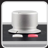
Hardware monitor control