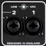
Pristine class leading AD/DA