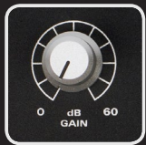
Superb audient mic preamps