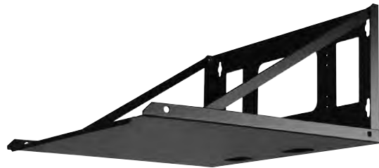
It can be installed in either direction.