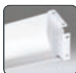
Large style Targa case