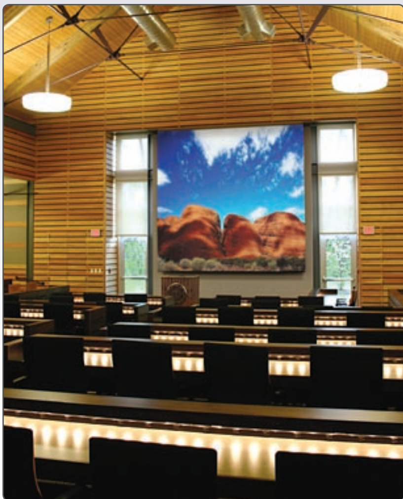
Targa with large style case at DePauw University's Prindle Institute for Ethics. LEED® Silver certified.