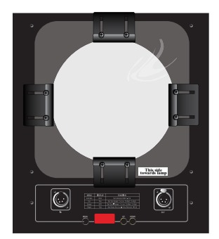
[ Brackets set for maximum frame ]

Brackets on the PRO 5.25 adjust from 4 1/4" to 5 1/2" Brackets on the PRO 7.25 adjust from 6 1/4" to 7 1/2" Brackets on the PRO 10 adjust from 9" to 10 1/4"