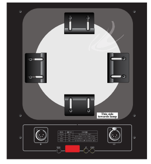
[ Brackets set for minimum frame ]

A safety cable is provided with each SMART COLOR® PRO. Be certain to attach the safety to a pipe or truss supporting the lighting fixture.