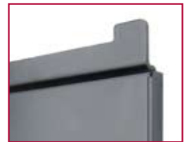
Specially designed safety tabs for secure support