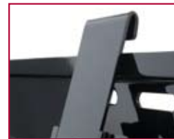
Easy hook-on design

* Designed exclusively for use with ultra-thin screens 2" (51 mm) deep or less