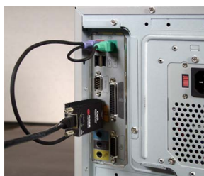
Direct connect CAT5 Transmitter streamlines your installation

As the inventors of the KVM switch, Rose continues to provide leading solutions for your server management needs. With headquarters in the US and offices in Europe and Asia, Rose provides a full range of capabilities and support. Call us today for more information about this and other Rose products.